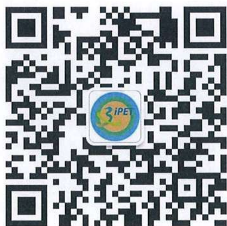
环保技术国际智汇平台微信公众号二维码

欢迎关注微信公众号“环保智汇平台”，有关评审过程及结果信息将通过微信公众号发布。